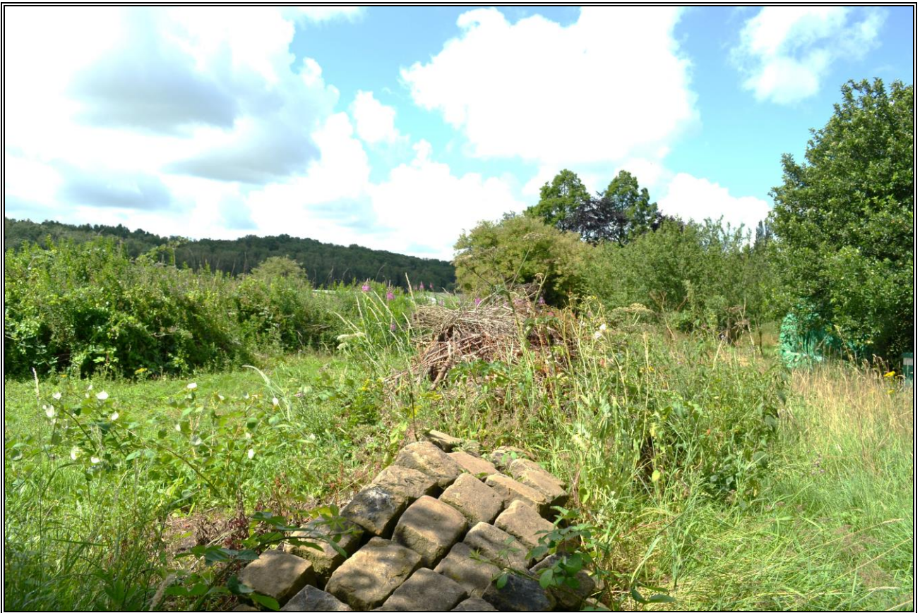
Three Building Plots adjacent to 148 Higher Walton Road, Walton-le-Dale, Preston, PR5 4HR