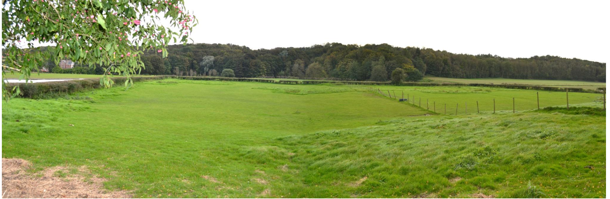
Three Building Plots adjacent to 148 Higher Walton Road, Walton-le-Dale, Preston, PR5 4HR