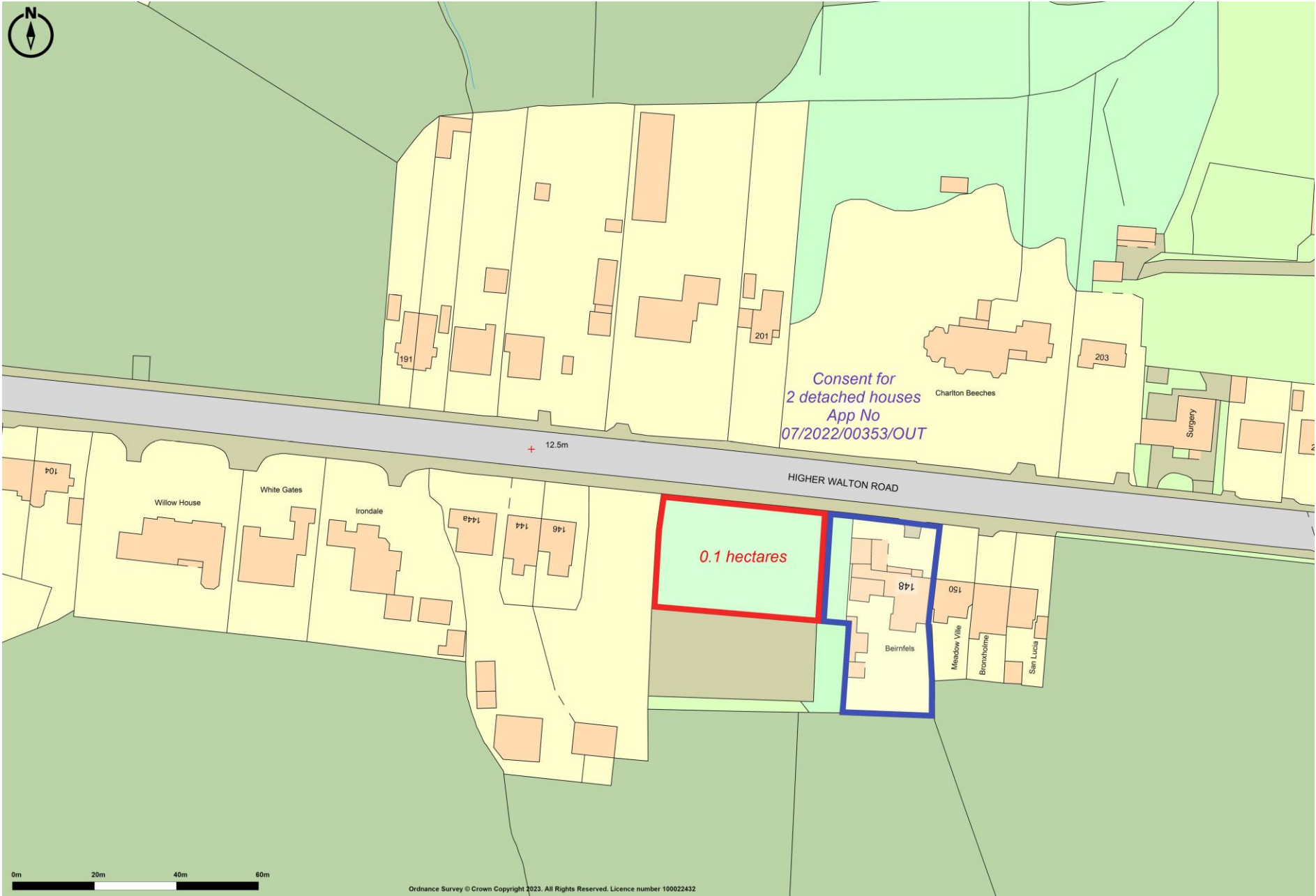
Three Building Plots adjacent to 148 Higher Walton Road, Walton-le-Dale, Preston, PR5 4HR